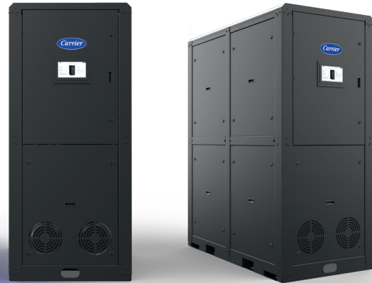
Carrier CDU 65LL

A Carrier QuantumLeap™ Data Centre Solution