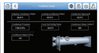
Real-time data points